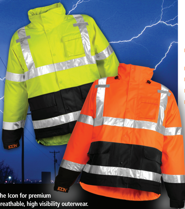
The Icon for premium breathable, high visibility outerwear.