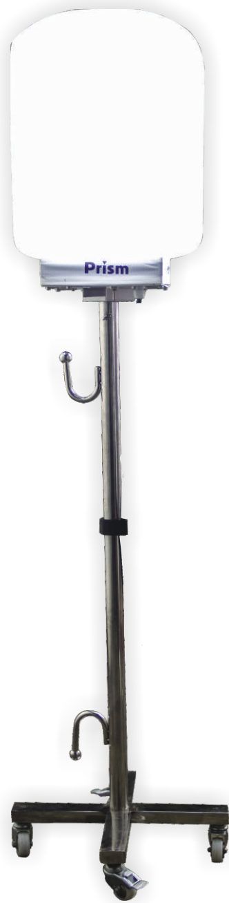
PMBL 100 / 160