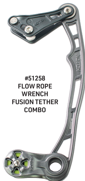
#51258 FLOW ROPE WRENCH FUSION TETHER COMBO

51258 Flow Rope Wrench Fusion Tether Combo $289.99