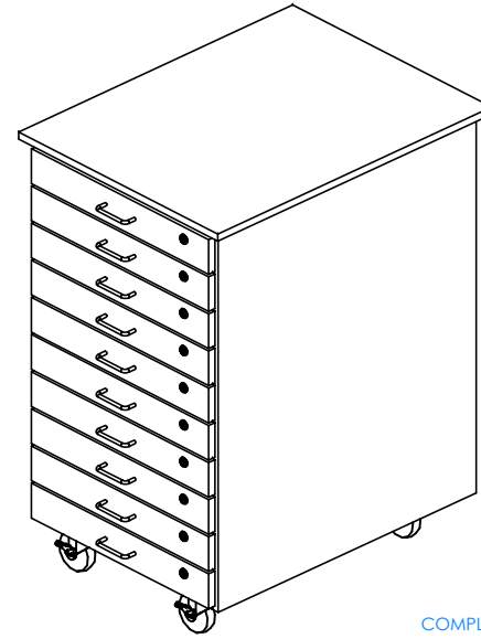
COMPLETE UNIT SHOWN

TAKE OUT THE FIRST COUPLE DRAWERS ON THE BOTTOM AND ATTACH THE CASTERS FROM INSIDE OF THE CABINET USING THE HARDWARE PROVIDED.